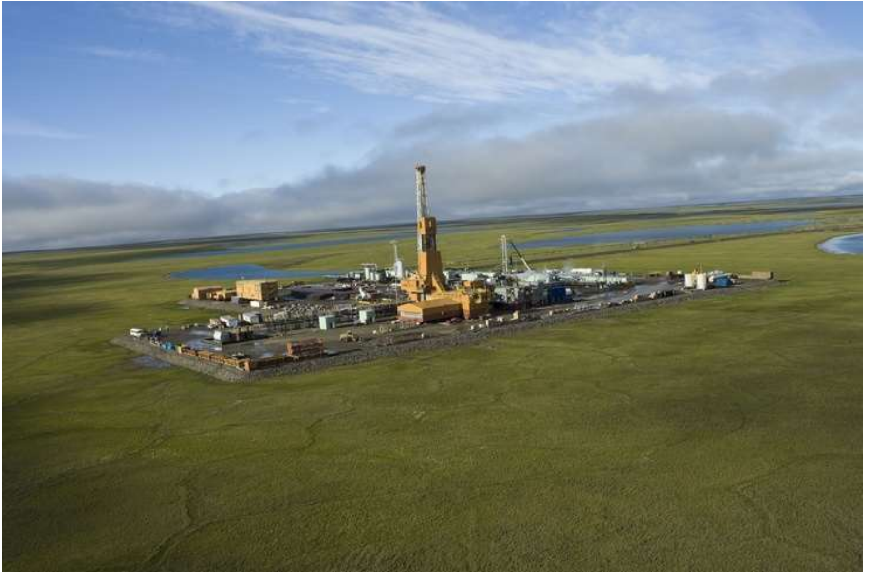
Alpine Oil Field, North Slope Alaska